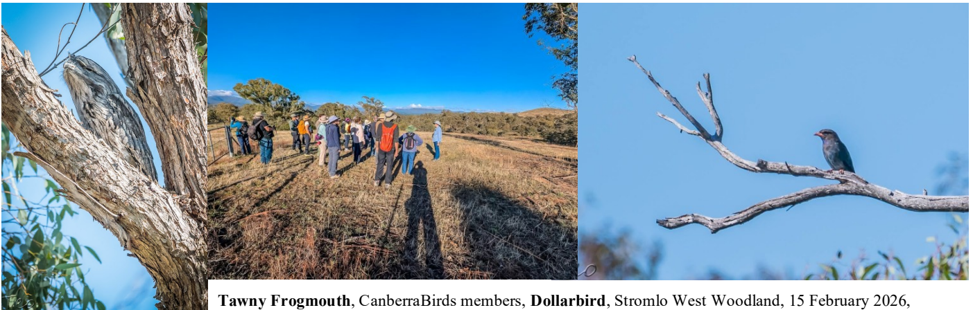
Tawny Frogmouth , CanberraBirds members, Dollarbird , Stromlo West Woodland, 15 February 2026, Tee Tong Teo