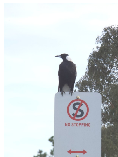
Australian Mappie, National Arboretum, ACT, 22 February 2026

Heading up Boundary Road, we watched with amusement as the Noisy Miners , Australian Raven , Pied Currawong , Common Starling , Common Myna and White-winged Chough feasted on figs in the fig plantation. Later in the morning we encountered a volunteer with a rather poor harvest to make jam for fundraising.