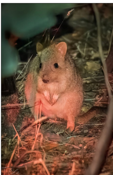
Eastern Bettong, Mulligans Flat NR, 10 February 2026, Tee Tong Teo

Red-necked and Swamp Wallabies, Eastern Bettongs, Common Brushtail Possums and Echidnas provided interest along the way, in addition to many Eastern Grey Kangaroos.