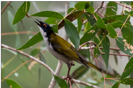
White-naped Honeyeater