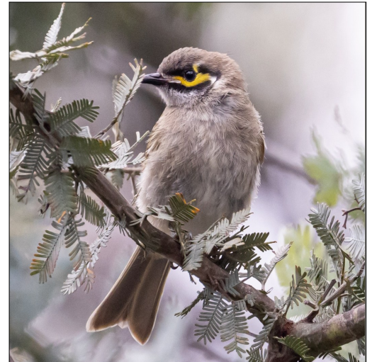
Yellow-faced Honeyeater - John Hurrell

The survey sites, their location and a copy of the recording sheet can be found on the Honeyeater Survey web page on the Canberra Birds website.