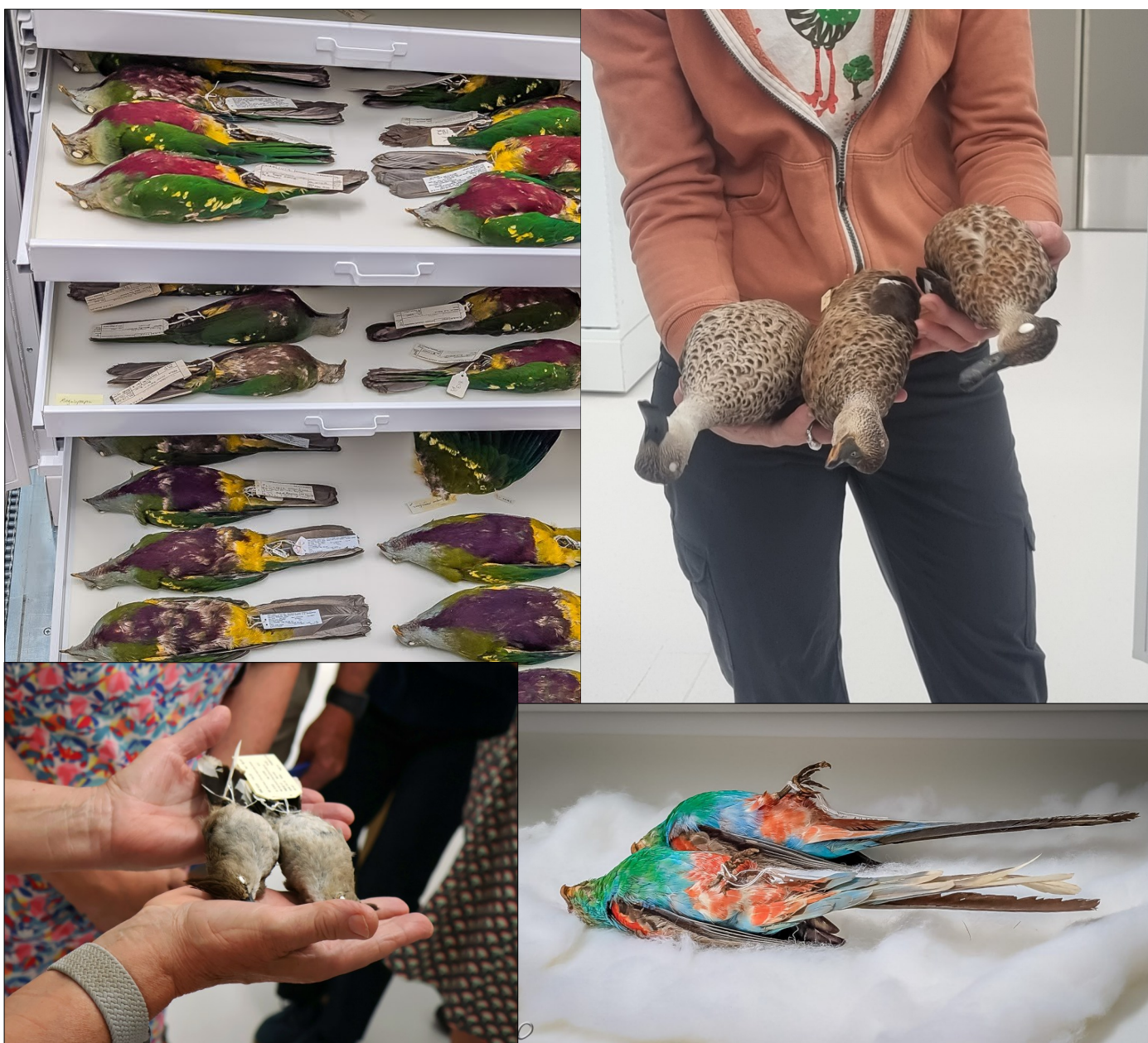
Clockwise - Wompoo Fruit Dove , Tee Tong Teo; Grey & Chestnut Teal , Julie Hotchin; Paradise Parrot , Tee Tong Teo, Chirruping & Chiming Wedgebill , Venus Mizubata; ANWC, February 2026