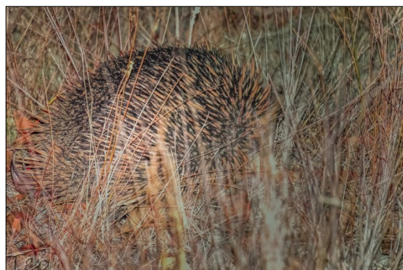
CanberraBirds Members; Echidna, Mulligans Flat NR, 10 February 2026, Tee Tong Teo