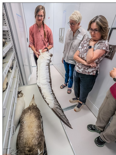
Wandering Albatross wing, ANWC, February 2026, Tee Tong Teo

The 'Bird Vault' is a purpose-built storage for bird specimens housed at the ANWC. The specimens are preserved for research, such as into plumage and colour variation, and to provide genetic material for DNA and isotopic research, and for questions that will arise in the future. The specimens are arranged carefully by species in draws in taxonomic order (although the sequence was finalised not long before AviList was released). Male birds face forward or left and female birds are placed facing right, which is easily remembered, as Tonya quipped, 'Girls are always right'.