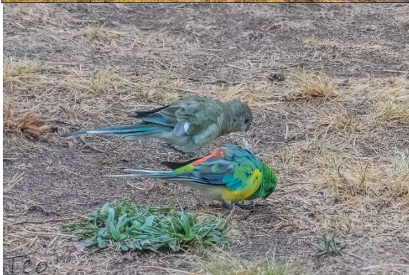
CanberraBirds members, Red-rumped Parrots , Lake Tuggeranong, 8 February 2026, Tee Tong Teo

At Isabella Pond, there were greater numbers of Maned Duck and Pacific Black Duck along with Grey Teal . Additional species sighted here included Hardheads , Australasian Grebes , Little Pied Cormorant , Little Black Cormorant , Australian Pelican and White-faced Heron .