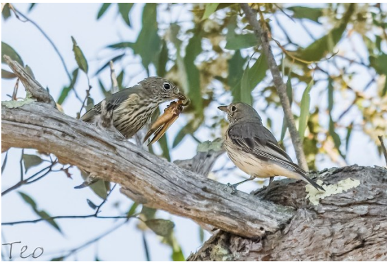
Western Gerygone, Stromlo West Woodland, 15 February 2026