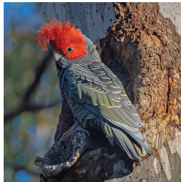
Gang-gang Cockatoo. Australian National Botanic Gardens. Ben Milbourne, 2023