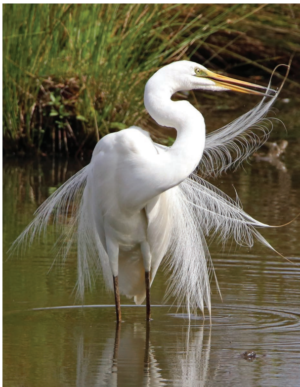
Great Egret. Jerrabomberra Wetlands Nature Reserve.

We also offer a wide range of activities, services and resources to our members, along with opportunities to get involved in a variety of citizen science projects.