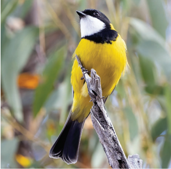
Golden Whistler. Mulligans Flat Nature Reserve.