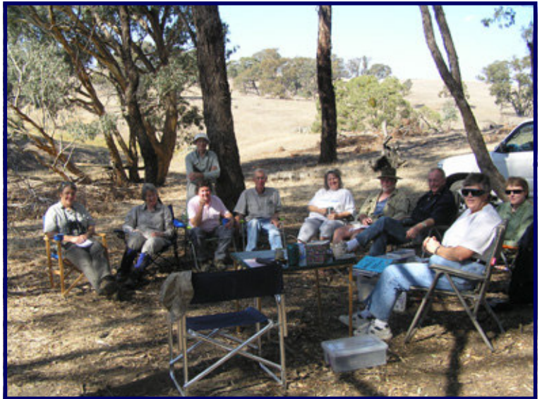
Group relaxing around camp on Frog's Hole Creek.

Some of us ventured further north on Sunday on a circuitous route home and others checked out the antique and craft shops in Frogmore and Boorowa. One group dropped into Hovells Creek Threatened Species Reserve just north of Frogmore