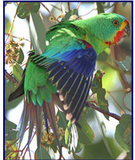
Swift Parrot ( Lathamus discolor)