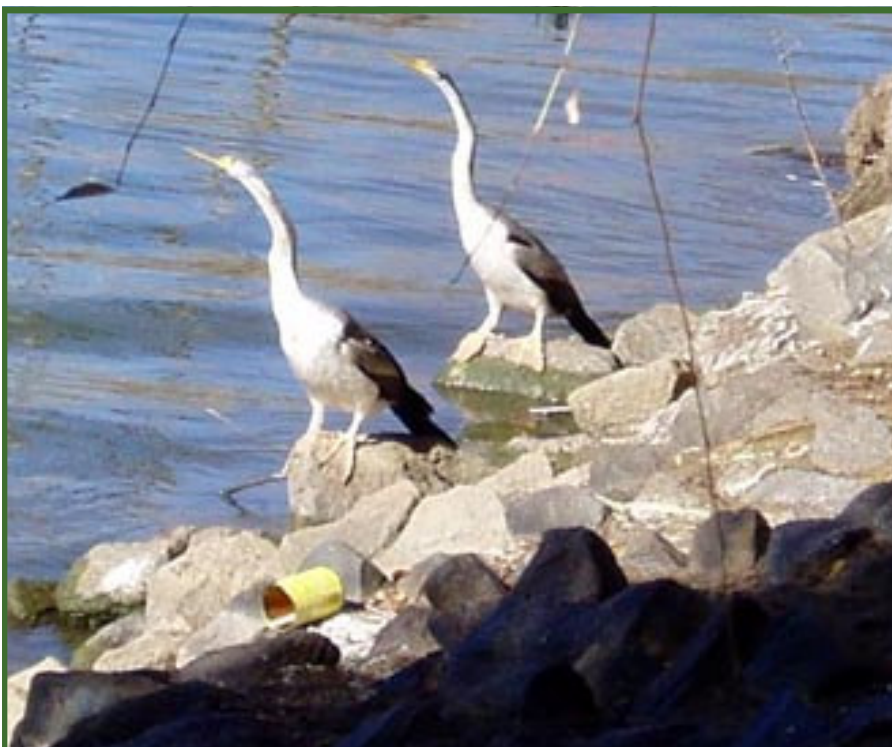
Darters on Aspen Is. ( Anhinga melanogaster ) Martin Butterfield

Round thirty five species were seen for the morning, again testament to the richness of this area. These included a number of land birds, the highlight of which was an accipiter species that allowed us very good views while perched on a tree on the bank. As usual this posed some identification difficulties, and consensus was not reached as to