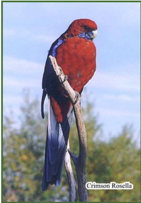
Crimson Rosella ( Platycercus elegans )