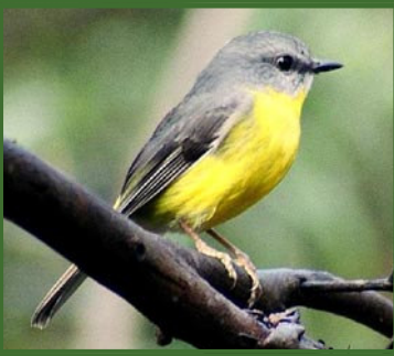
Eastern Yellow Robin ( Eopsaltria australis )