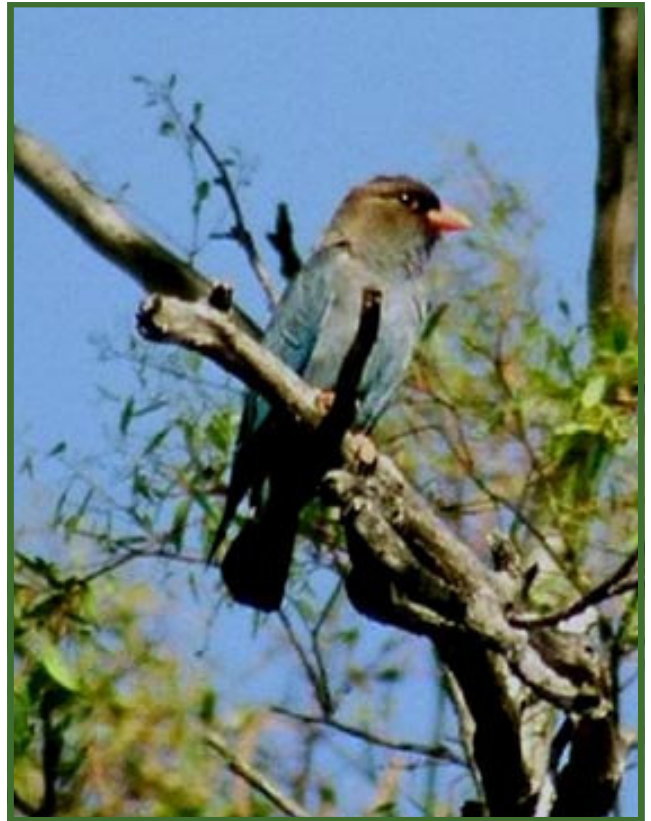
Dollarbird ( Eurystomus orientalis )

Adrian's studies at the microscale included observations of flying, feeding on the ground and in trees, and the number of trees, shrubs, logs and rocks in the landscape. He found