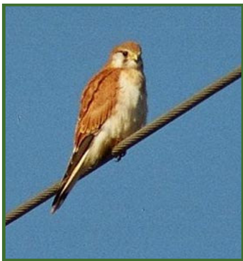
Australian Hobby ( Falco longipennis )