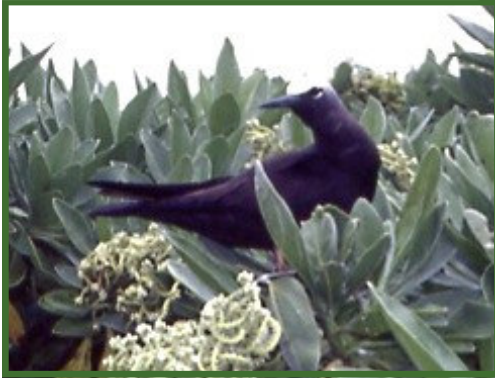
Black Noddy ( Anous minutus )