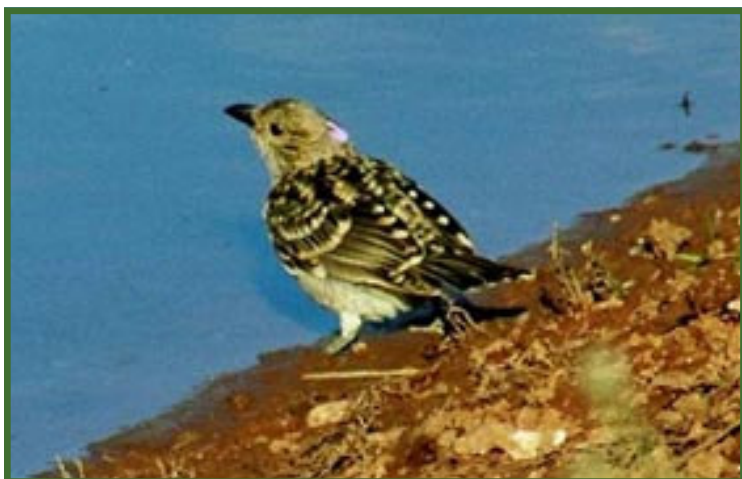
Spotted Bowerbird (Chlamydera maculata)

For our outing over this long weekend in June COG has booked the two duplex cottages associated with the lighthouse at Green Cape.