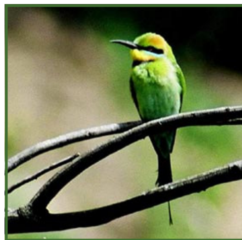
Rainbow Bee-eater ( Merops ornatus )

The next Cowra Woodland survey will be held over the weekend of 19-20 June. If you are interested in participating please contact Sue Proust on thebradybunch8@bigpond.com .