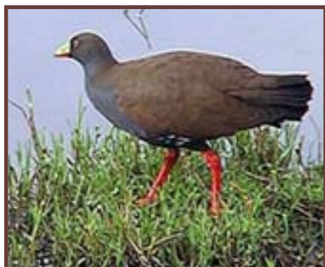
Black-tailed Native-hen ( Gallinula ventralis )