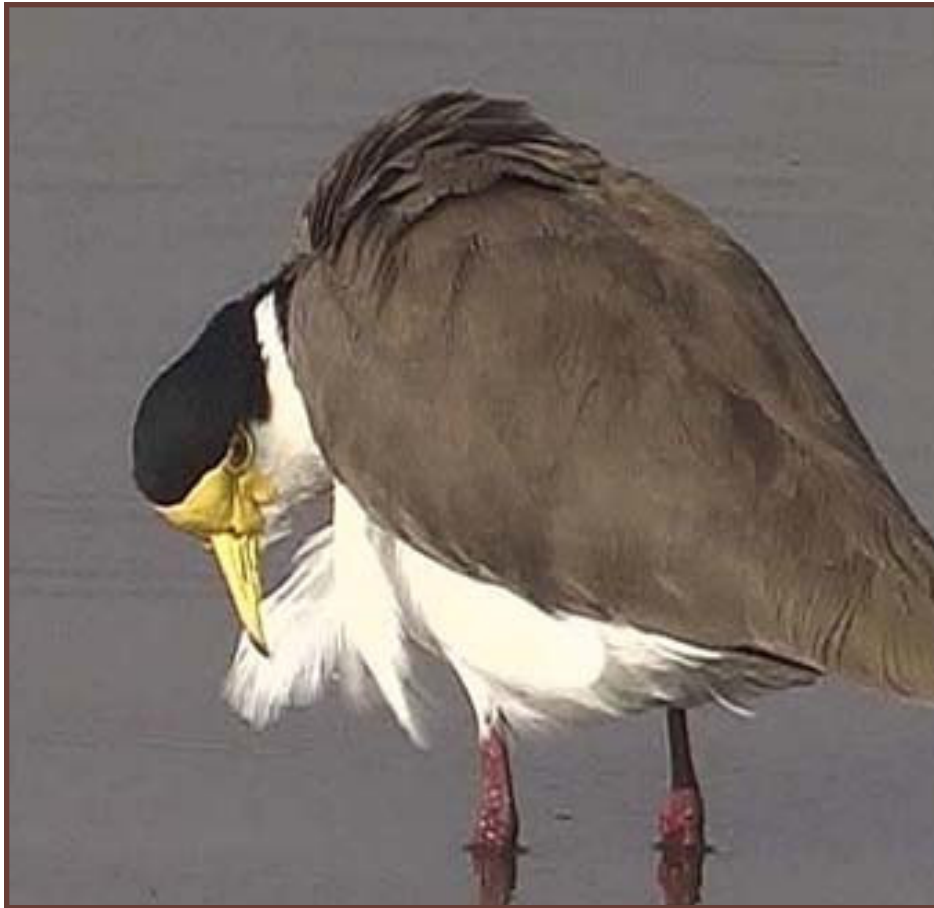
Masked Lapwing ( Vanellus miles )