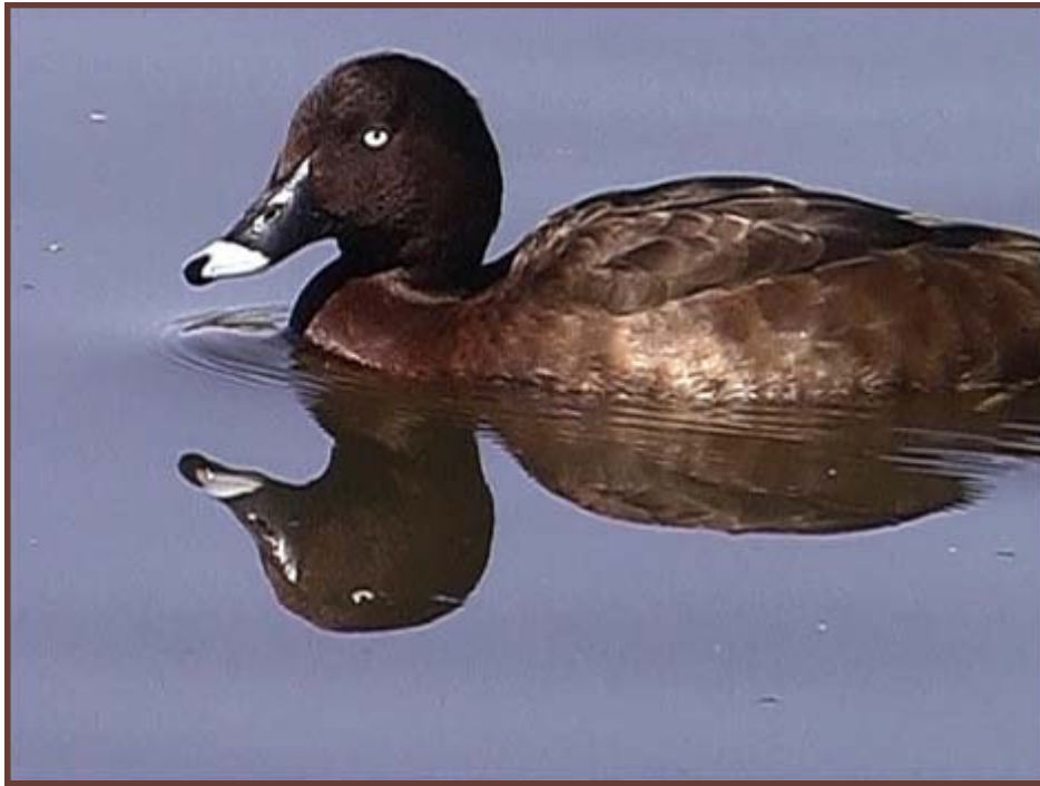
Hardhead ( Aythya australis )