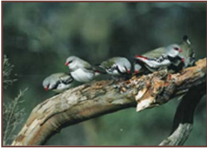
Diamond Firetails ( Steganopleurs guttatum )