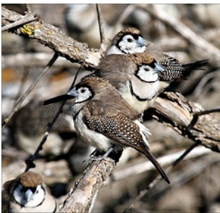
Double-barred Finch ( Taeniopygia bichenovii )