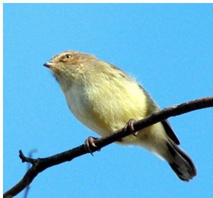
Weebill ( Smicronis breviostris )

These observations are just a glimpse into very different ecological circumstances for our birds in both winters. In 2007 the drought meant there was only limited food for the larger honeyeaters and they moved out of town, while in 2008 there is plenty of food for them (mainly lerps at the moment), hence many birds can stay. For the Weebill , in 2007 the woodlands no longer provided enough food, and some found reprieve in suburbia, but in 2008, it seems, they have no need to leave the woodlands. No doubt, many factors are involved, and the situation is different for every species, but very exciting, indeed.