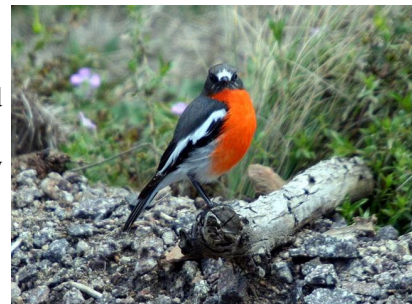
Flame Robin ( Petroica phoenicea )

Our search over a number of week-ends have confirmed the very low numbers of Flame Robins compared with recent winters, with their absence from many areas in which they had been previously present also confirmed by other observers. By contrast, July seems to have resulted in an influx of Scarlet Robins , with at least 4 pairs in my local patch on