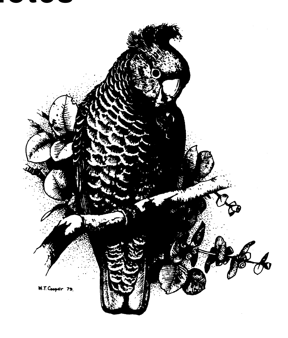
Registered by Australia Post — Publication No. NBH 0255